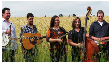
Blue Horizon 2009 Exciting New Band! Sat. & Sun. Sept. 4 & 5