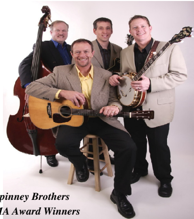
The Spinney Brothers ECBMA Award Winners Sat. & Sun. Sept. 4 & 5

All Performances Under Cover Come Rain or Shine and Bring Your Own Lawn Chairs